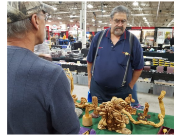
What were you thinking??