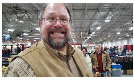
So many people!!!!