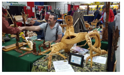
Making new friends.