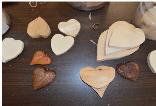
Grants assorted hearts for his project.