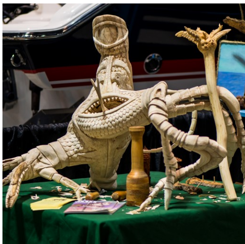
Andre's "Monster in the basement" is a work in progress, will be renamed when done!

CWCA monthly meetings are open carving sessions for ALL that wish to attend. Bring your own project, or give the featured monthly project a try! Carving tools not provided by CWCA. Children under 10 welcome, but please contact us ahead of time for tips and any special instructions.