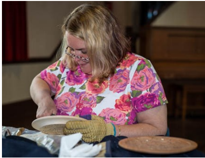
More from our day in Monson Mass.