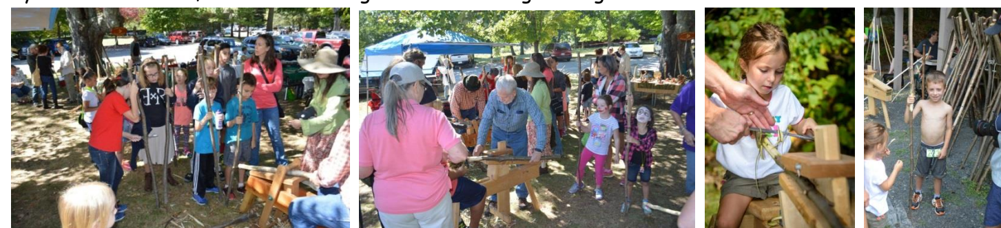
Family Nature day @ White Memorial Conservation Center, and "Run for the Woods" at Sessions Woods