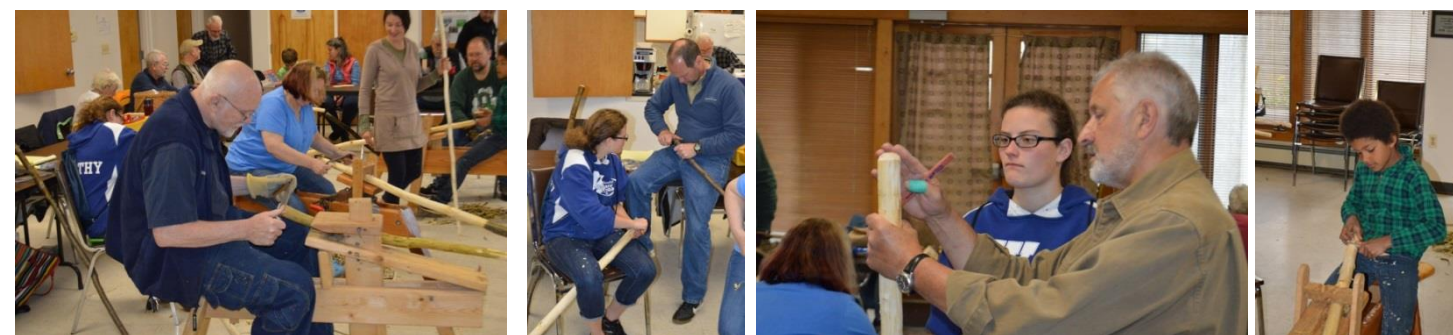
CWCA's past walking stick demonstrations at our monthly meeting...

There will be no Mystic Woodcarvers Retreat Columbus Day weekend in 2017. There will be a Columbus Day Retreat October 5th - 8th, 2018 at Camp Canonicus, 54 Exeter Rd., Exeter, R.I.