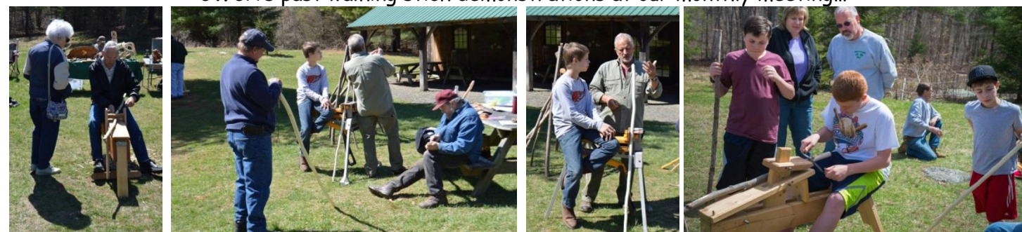
Flanders Nature Center Woodbury CT