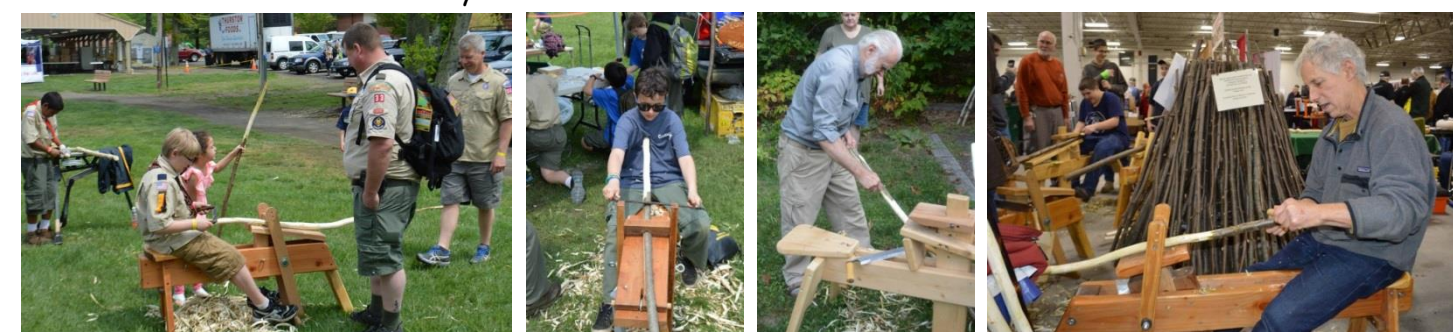
Boy Scout Jamboree, the Woodworking Show at the Big E in Agawam MA.