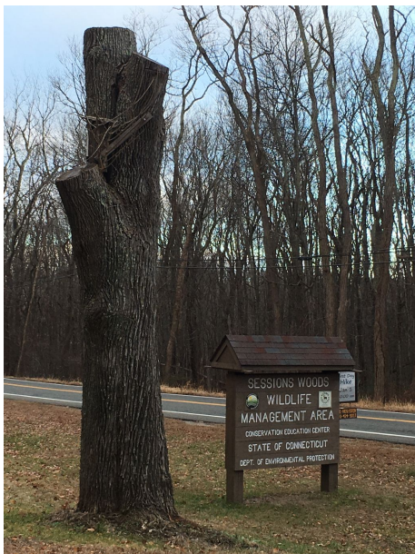
The Sessions Woods Tree- a potential club carving project.