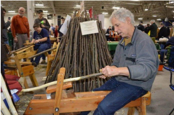
New England Woodworking Show at the Big E fairgrounds Agawam Ma